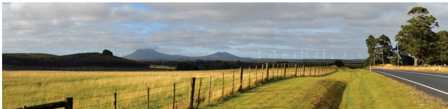
Photomontage showing what Hellyer Wind Farm (and the adjacent proposed Guildford Wind Farm) would look like from Ridgley Highway near Guide Reservoir.