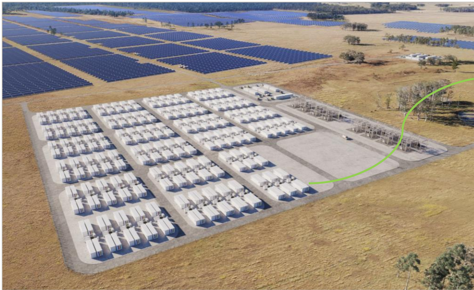
Artist's impression of the BESS, which would occupy an area of approximately 9.1 hectares.

An energy management system (EMS) will monitor energy stored and needed, and manage charging and discharging of the batteries. This will provide stabilisation and inertia services to the electricity grid making the grid more resilient and stable. It will charge when market prices are low and discharge when market prices are high which will reduce the overall cost of electricity for consumers.